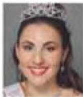
Queen Auri Hatheway* $1,050,000