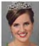
Queen Allison LaMarr* $1,250,000