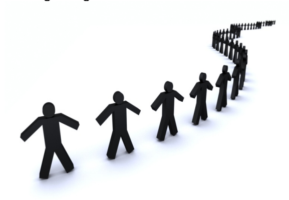
The fundamental flaw in MLM is the <u>endless chain</u> <u>of recruitment</u> of participants as primary customers. MLM pay plans assume infinite markets and virgin markets – neither of which exists in the real world.

consistent pattern of pay plans that are recruitment-driven and top-weighted, meaning they are driven by incentives to recruit, with company payout of commissions going primarily to founders and a select few "TOPPs" (top-of-the pyramid promoters) who are usually those who were positioned at the beginning of the recruitment chain.